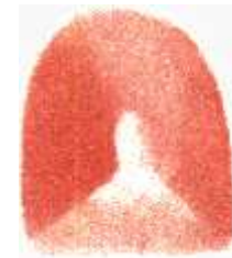
Anderson/Ocone Behavioral Health Services